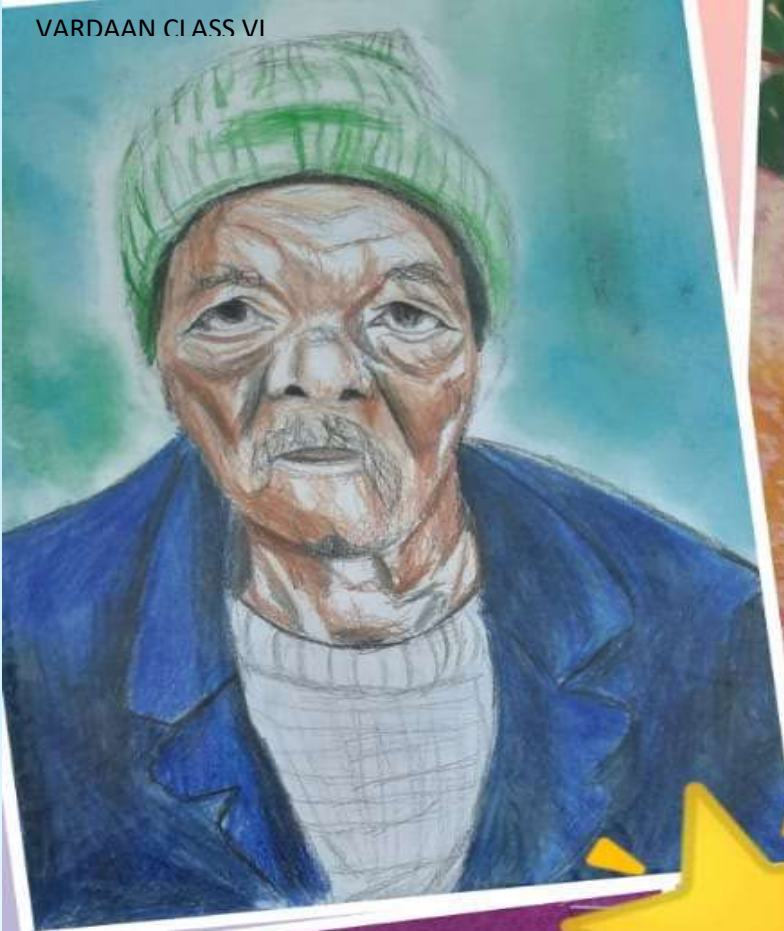
VARDAAN CI ASS VI