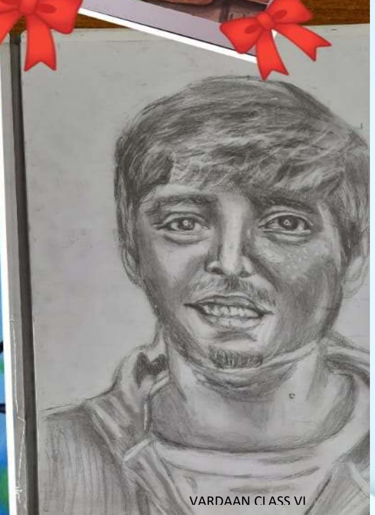
VARDAAN CLASS VI