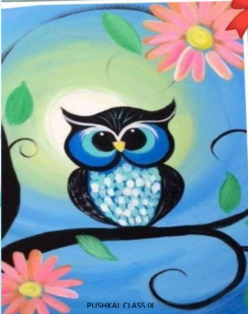
PUSHKAI CLASS IX