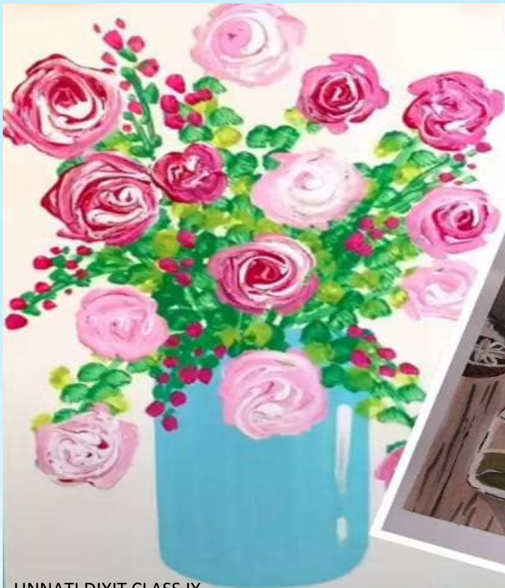
UNNATI DIXIT CLASS IX