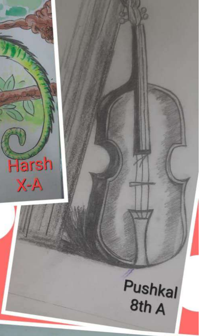
Pushkal 8th A