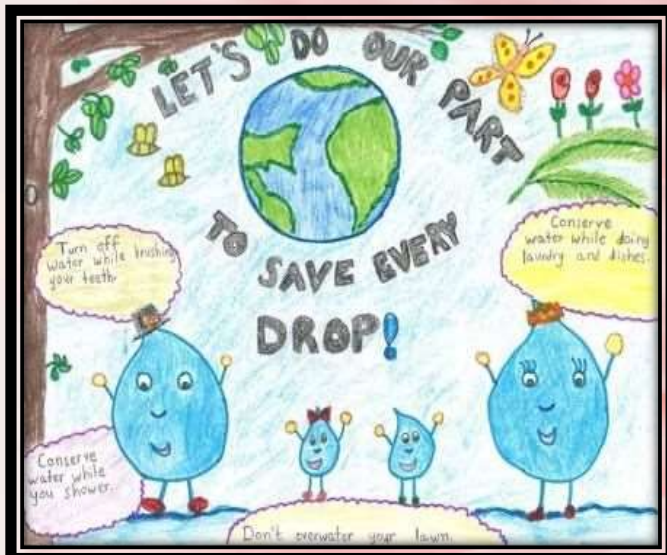
Prabhjit Class IV