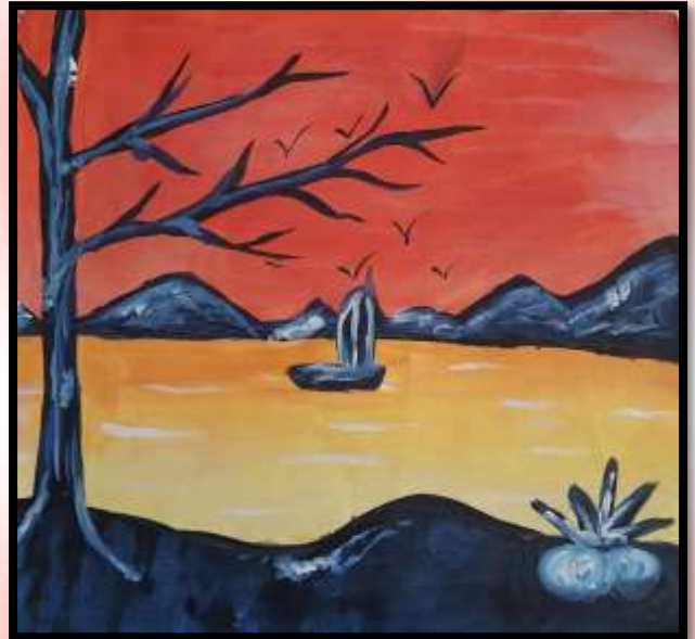
HARSH CLASS VII