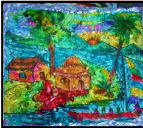
UNNATI CLASS V