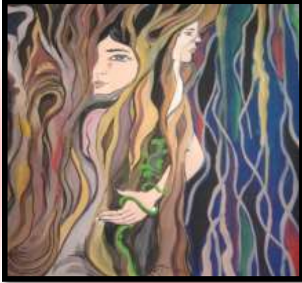
SALONI CLASS X