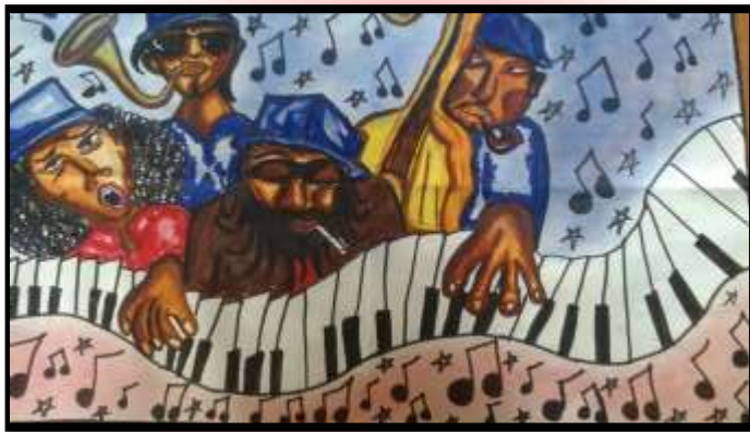
HARSH CLASS VII