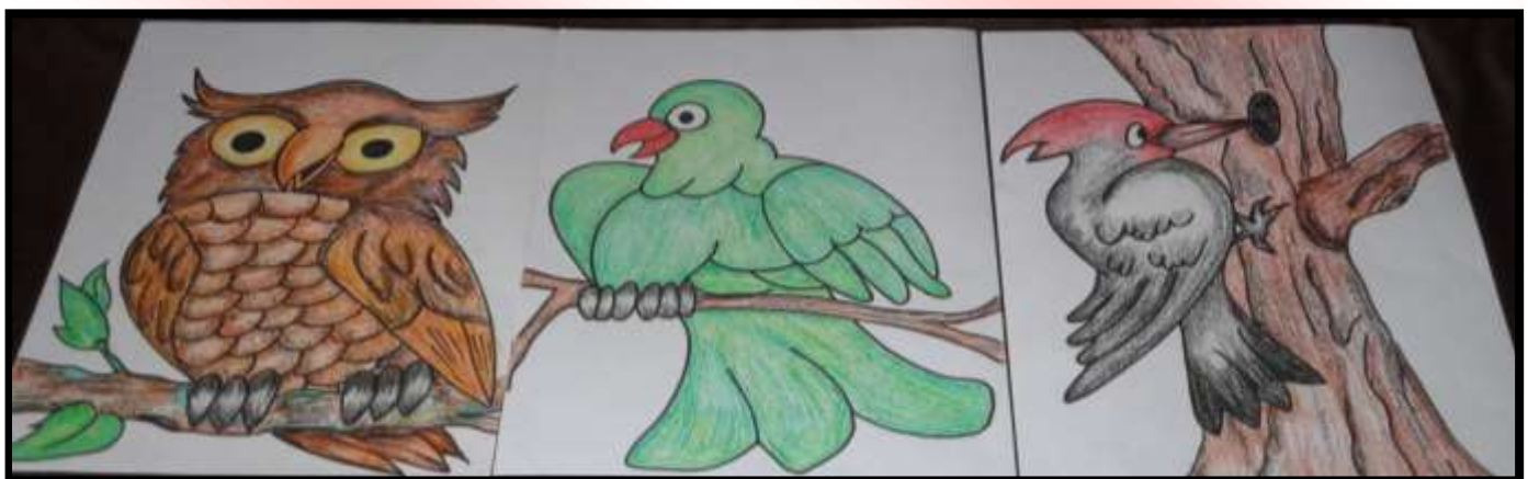
TRISHA SINGHA CLASS VIII