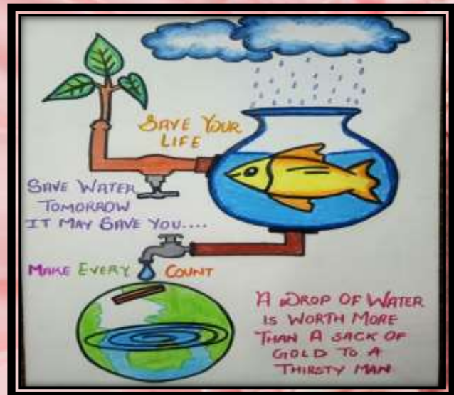
Latika Class IV