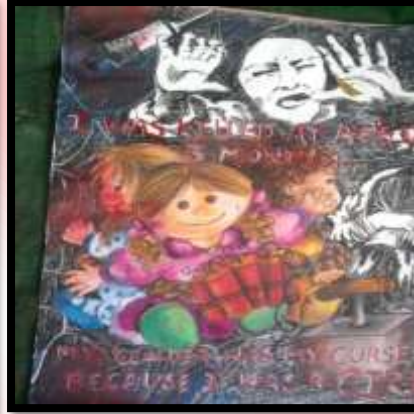
MISHKA CLASS X