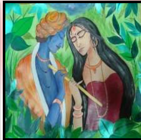
SAKSHI CLASS X