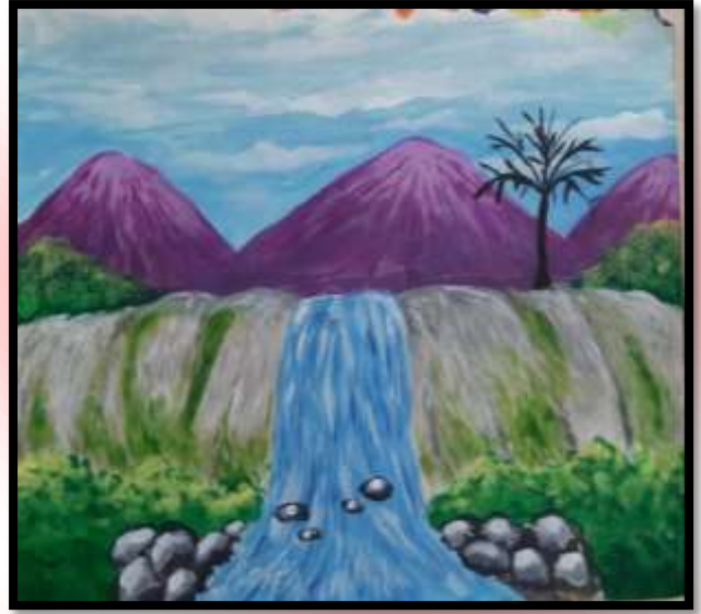
GEETANSHU CLASS VI