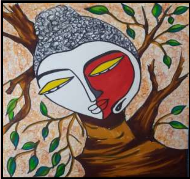
ADITI CLASS VIII