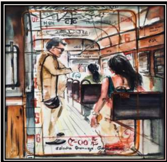
Trisha Singha Class VIII

Selected entries for poster making activity are as follow: