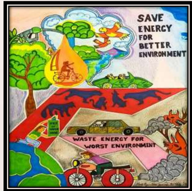
Khushi Bhagel Class X