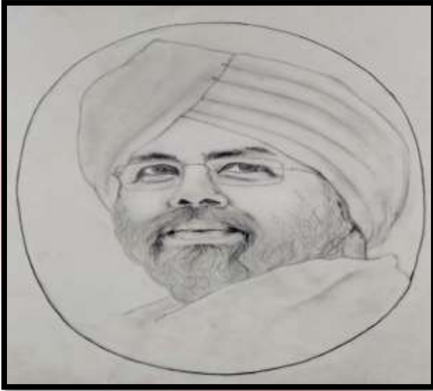
ZENIA CLASS V