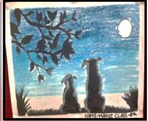
MANSI CLASS VIII